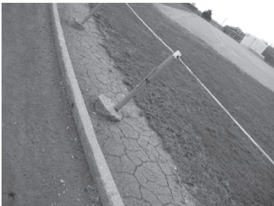
The old track is worn out

So, when an organization is trying to raise money for a project that only seems important to them, most likely it will benefit you as well. Give back to your community and help the surroundings too: Together, we can make it better.