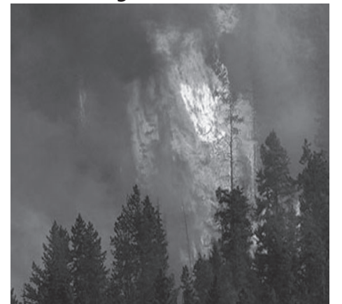
The blazing inferno

A spokesman for the firefighters said, "The threat will remain for weeks to come." Firefighters have been fighting the fires for weeks and recovering people, whether they were dead or alive. There are also several