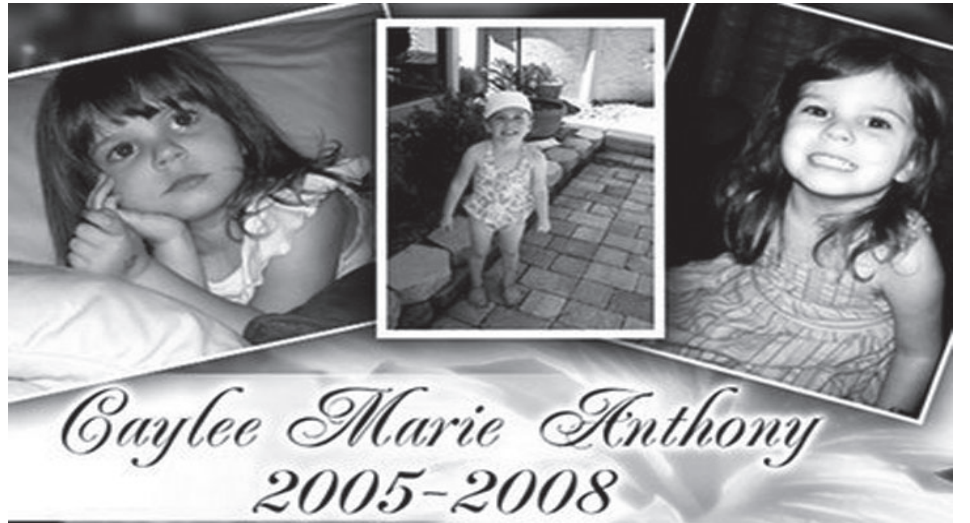
Caylee Marie Anthony 2005-2008

Casey Anthony will more than likely go through the rest of her trials emotionless and not say a word about whatever the sentencing may be. Because she is a sociopathic criminal, if she is found guilty and the death sentence is imposed (which is allowed under Florida law) then Anthony will more than likely die feeling as if she has won against the law enforcement, her family and the public. Keeping secrets makes her feel as if she is better than everyone else and that she has complete control over everyone.