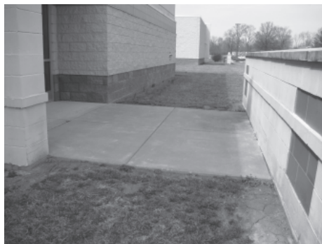
Where the sidewalk ends!

I believe if we were able to get some fresh air after every class that we would have a better attitude about our work and school in general. We would also not be so anxious to get out of school to be outside in the nice weather. The hallways would not be as crowded. The sophomore/junior hallway is