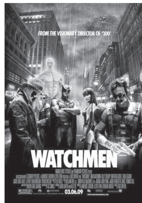
Who watches the Watchmen

Alan Moore, writer of the Watchmen comics, was somewhat adamant about the idea of Watchmen being a movie. Moore said, "I didn't think it was filmable". The movie has been getting mainly positive to