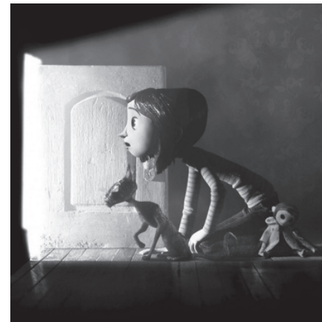
"be careful what you wish for"

of other children the parents had taken before, and when Coraline returns to her real home and family, she finds that her real parents are missing. They do not return by the next day and Coraline, discovering they were kidnapped by her other mother, resolves to rescue them. Coraline then went back into the other parents' world to challenge the other mother in a game to find the children's souls and her parents within the other parents' world. Coraline finds the others' souls and escapes to the real world, forcing the door closed on the other mother and severing her hand. Back in her home, Coraline finds her parents safe and sound.